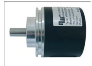
Absolute encoder WDGSL00G