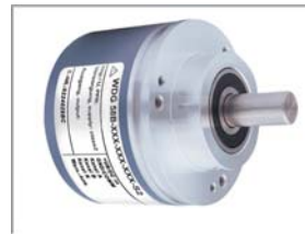
Incremental encoder WDG58B

Put together your own system for shaft copying, by selecting an encoder and specifying the length of the special belt.