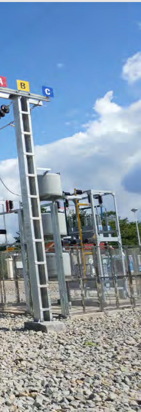
TBB22-2500/210-BLW capacitor bank operates in Laos