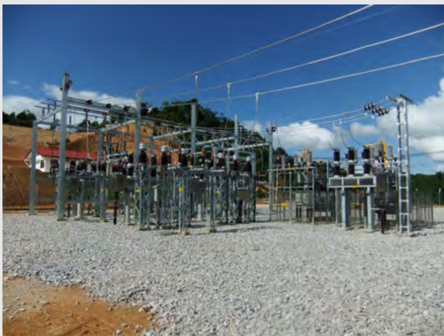
TBB22-3600/200-BLW capacitor bank operates in Laos