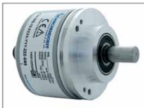
Incremental encoder WDG158B

Put together your own system for shaft copying, by selecting an encoder and specifying the length of the special belt.